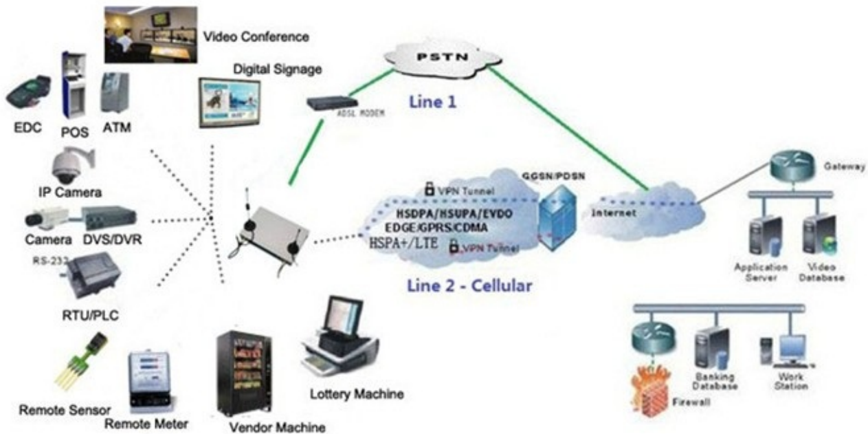
Single H820 Typical Application Diagram