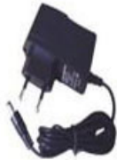
EU Power Supplier