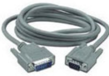
DB15 to DB9 Cable