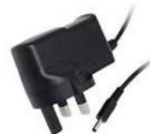
UK Power Supplier