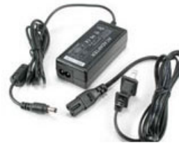
Desktop Power Supplier EU, US, AU, UK for choice