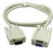
DB9 serial cable