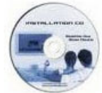
CD-Rom with Manual/Data