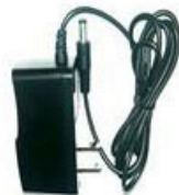
US Power Supplier