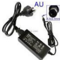
AU Power Supplier