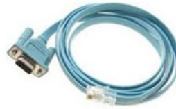
RJ45 to DB9 Cable