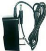
US Power Supplier