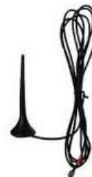
Rubber Magnetic-Mount W/ Cable