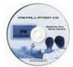
CD-Rom with Manual/Data