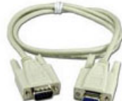
DB9 serial cable