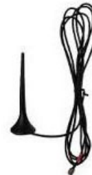
Rubber Magnetic-Mount W/ Cable