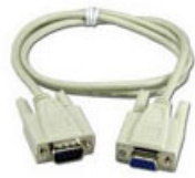
DB9 serial cable