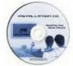
CD-Rom with Manual/Data