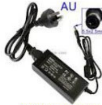
AU Power Supplier